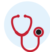
Health Care Policy