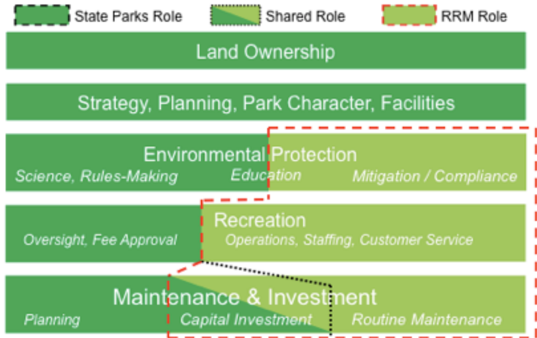
Figure 1: Delegation of Responsibilities in Park Operation PPPs

Note: In a park operation PPP, the full scope of capital maintenance and investment responsibilities would depend on the length and structure of the contract negotiated with the park's authority.